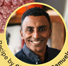
Recipe by Chef Marcus Samuelsson