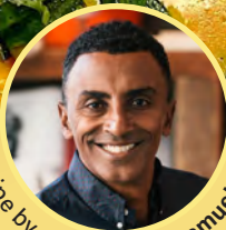
Recipe by Chef Marcus Samuelsson