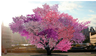
This single tree grows 40 types of edible fruit!

Inspiration: Sam's art combines sophisticated technology with traditional modes of art-making. His projects cross boundaries between artistic genres, including performance, installation, video, photography, and sculpture. With each body of work, he selects practices and new perspectives that provide a kinesthetic perception of objects and a visceral charge. His "Tree of 40 Fruits" utilizes the botanic science of grafting to produce real hybridized fruit trees.